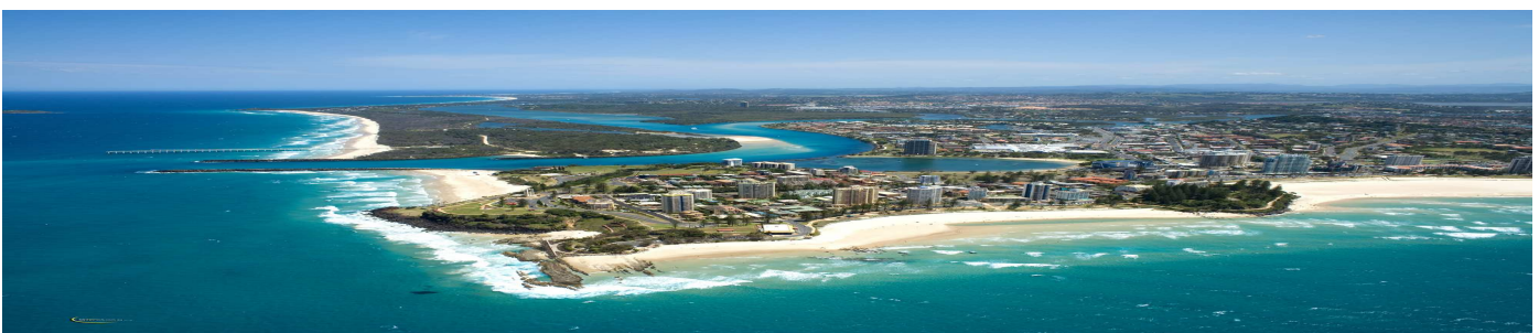
Aerial Image of Rainbow Bay used for the merchandise