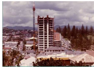
Rainbow Place Construction

Hope to see you soon enjoying a holiday in Rainbow Bay!